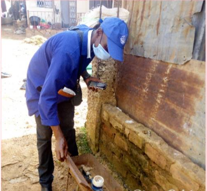
NWSC Staff have been provided with the necessary protective grear